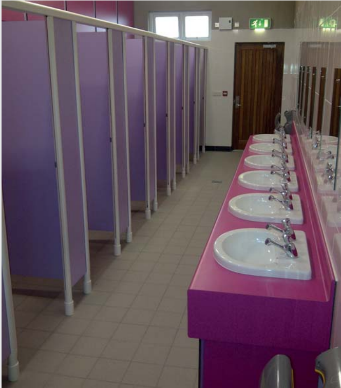
Diverse Print HPL at the Dieghan Caravan Park near Limvaldy in Londonderry