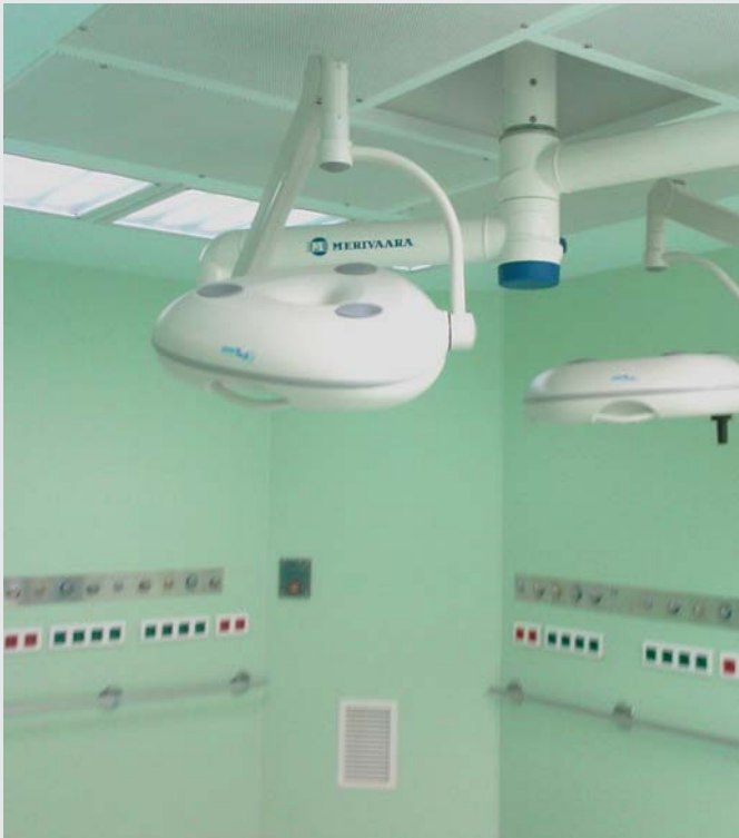
Labgrade operates hygienically in this hospital theatre