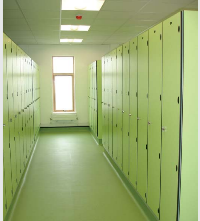
Stratificato compact grade laminate at Cambridge University