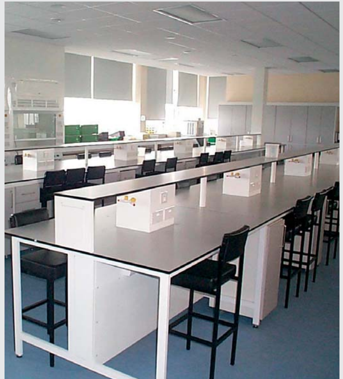
Labgrade surfaces at work in a school science laboratory